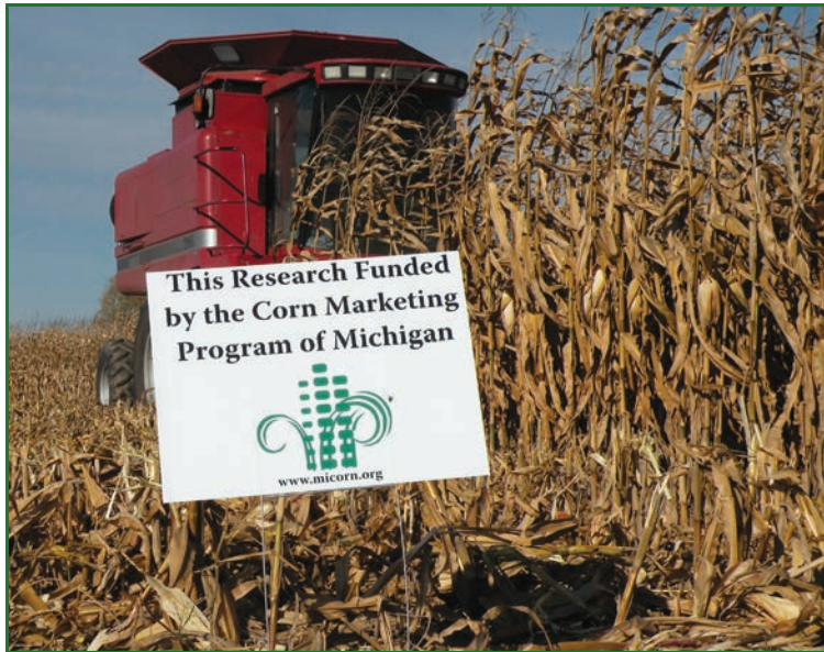
Fields of corn that are used for research funded by the CMPM are designated by a special sign that is put out in front of the field.

Farming techniques have changed dramatically since Michigan's early settlers plowed the land. However, even with all the changes, the goals and ideals of Michigan farmers still remain the same, to raise a healthy, high-yielding crop while being good stewards of the land.