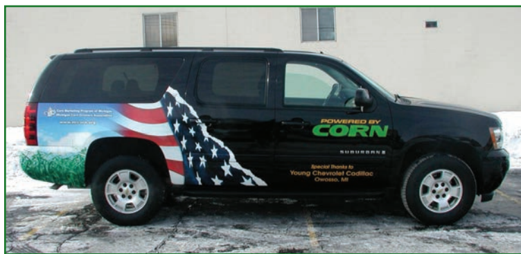
To promote ethanol use to motorists throughout the state the CMPM uses an E85 capable Chevy Suburban. The CMPM would like to thank Young Chevrolet of Owasco for their generous assistance in obtaining a flex fuel vehicle.

The corn heat industry is growing at a rapid rate due to the high prices of energy. Heating with corn has become a fast-growing alternative to the traditional heating methods of using propane and electricity. The CMPM has continued to work with the Corn Heat Task Force, an assembly of industry and government representatives, corn farmers and researchers, in an effort to help guide and enhance the corn heat industry.