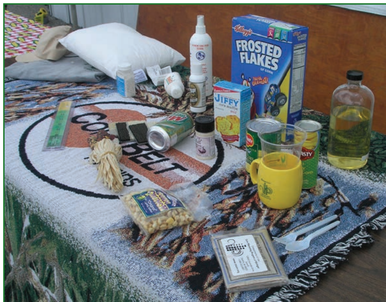
To emphasize the many uses for corn, the CMPM has exhibits that show the food, plastic and fiber products that are made from corn.

In an effort to advance the corn heat industry, the Corn Heat Task Force has worked on market development and education about the benefits of corn heat. Through the task force, a website that focuses solely on corn heat has been created, www.micorng.org/heat . The CMPM also has a list of those selling corn for corn heat available on this website.