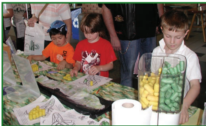
At the annual Earth Day Expo kids participated in an activity using Magic Nuudles. Magic Nuudles are a cornstarch based building block that were developed and commercialized from CMPM funding in Michigan.

Publications - In order to provide farmers and consumers with up-to-date information on the CMPM's activities and happenings within the corn industry, the organization releases several publications every year. In the past few years, three markets have emerged in Michigan that have generated much interest from both farmers and the public; these markets are ethanol, corn heat and corn-based plastics and clothing. The increased interest and demand for information has led the CMPM to create newsletters for each topic and to update them as needed. Copies of Heating with Corn, New Uses and Ethanol newsletters are available on the Michigan Corn website at www.micorn.org .