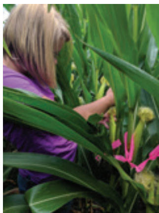
Injecting corn ears to induce ear rot for research.